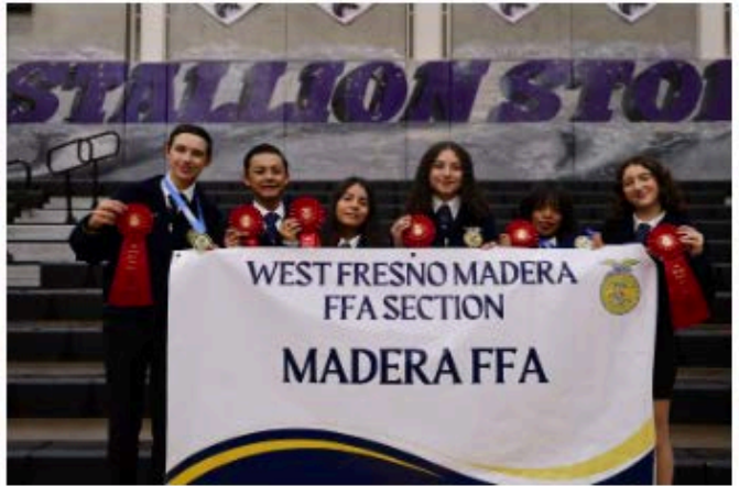
On November 13, Our Madera FFA chapter hosted over 650 members from our section at the sectional opening and closing contests. We had teams in all 4 divisions with multiple members winning outstanding officer awards and top 3 team awards.