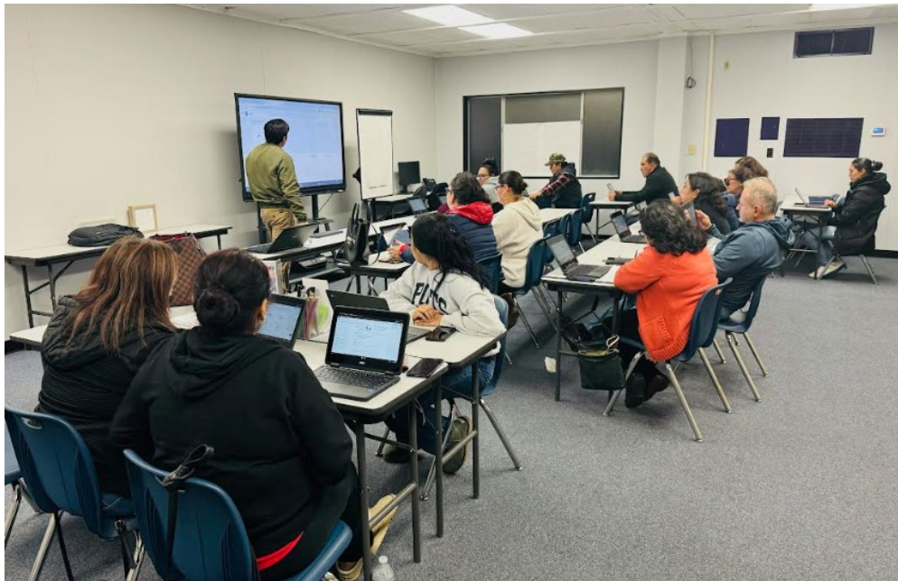
Stallion Parents Learning Technology

Parent education classes take place weekly in our Parent Resource Center. Classes are available that help parents access technology and school resources as well as provide guidance to parents to better support their child's social and emotional needs.