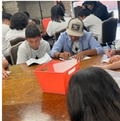
Madera FFA took 24 freshmen to the Greenhand Leadership Conference at Fresno State. They learned about FFA and leadership, their role in the organization, did career exploration, and planned their Supervised Agriculture Experience (SAE) project.