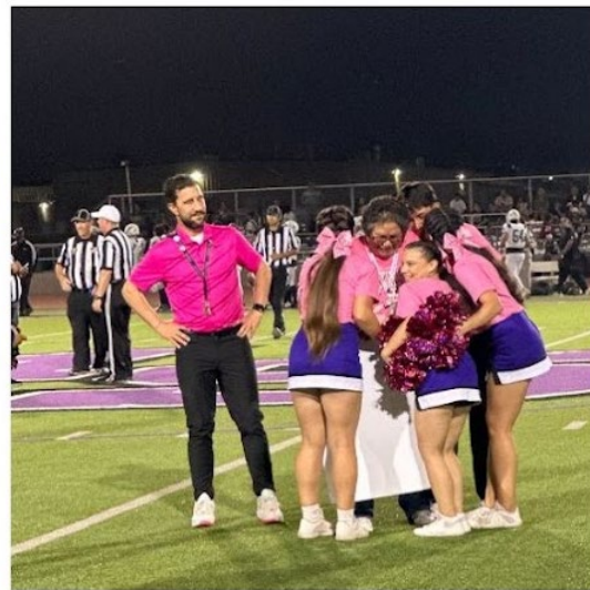
Staff & Student Highlights | FFA