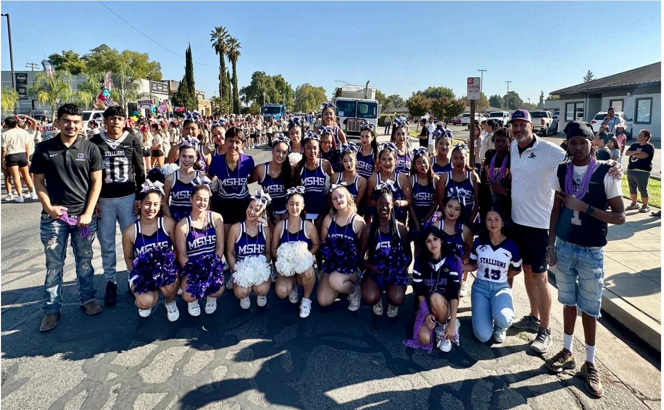
The Madera South Cheer and Pom team performed in the Madera Old Timers Parade. Madera South athletes joined in with everyone passing out purple beads and candy to the crowd.