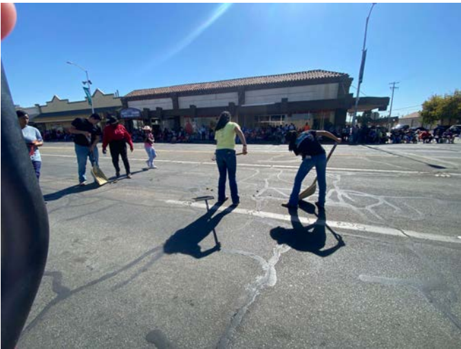
The Madera FFA community service committee was at the Old Timers Parade and were responsible for helping keep the streets clean as the "pooper scoopers."